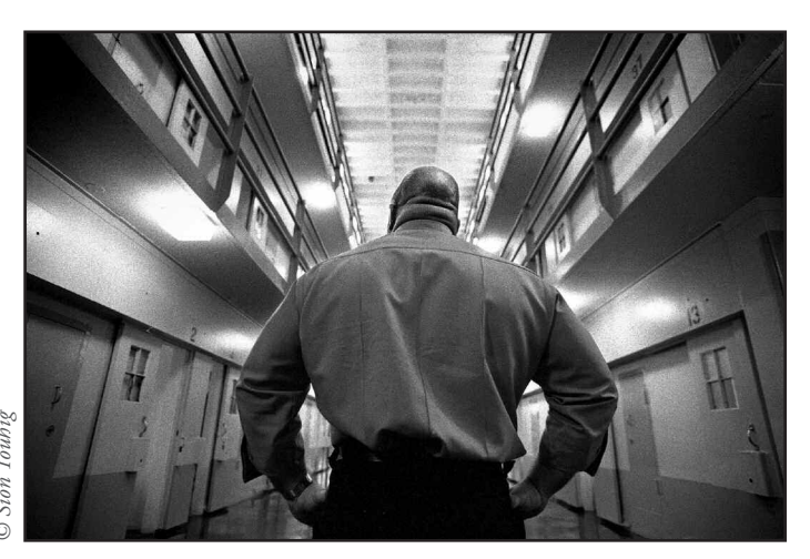
A guard patrols the cellblock at MCI Cedar Junction in Walpole, Massachusetts.

Beyond staff recruitment and retention, international instruments emphasize the importance of adequate experience and training for prison personnel so that they are qualified to enforce a deprivation of liberty while simultaneously upholding a prisoner's other human rights. The Code of Conduct insists that prison officials receive "continuous and thorough professional training."26 The Standard Minimum Rules similarly require that "[b]efore entering on duty, the personnel shall be given a course of training in their general and specific duties," and "[a]fter entering on duty and during their career, the personnel shall maintain and improve their knowledge and professional capacity by attending courses of in-service training to be organized at suitable intervals."27 Reports indicate, however, that private prison guards receive 35 percent fewer pre-service training hours than public corrections officers.<sup>28</sup> In addition, because of the high staff turnover rate at private facilities, large numbers of guards are new each year. These new staff members are often new not only to the private facility but also to