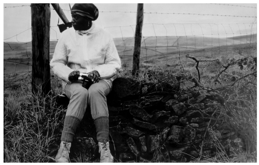
... it's as if the Black experience is only lived within an urban environment. I thought I liked the Lake District where I wandered lonely as a Black face in a sea of white. A visit to the countryside is always accompanied by a feeling of unease, dread...