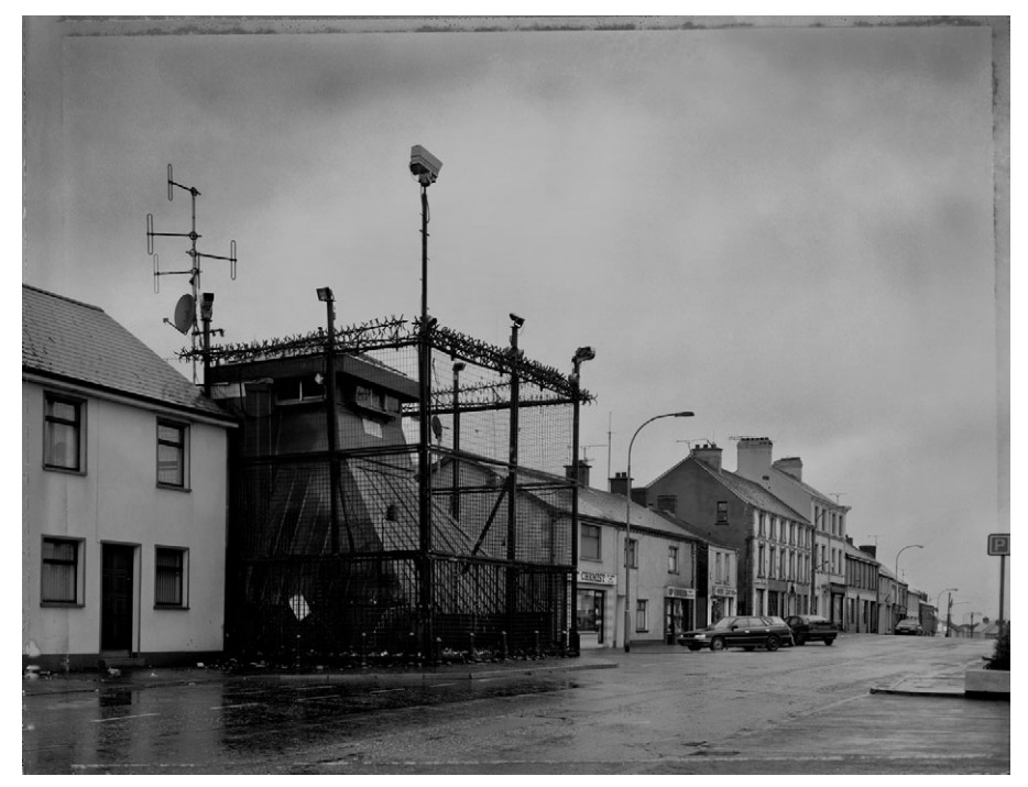
Fig. 7 Jonathan Olley, Golf Five Zero Watchtower. Crossmaglen, South Armagh, Northern Ireland, UK, gelatine silver bromide print, 1999. © jonathanolley.com

some important questions about the field of documentary practice and I want to conclude this discussion with two contemporary photographers who continue to explore the politics of everyday life. Jonathan Olley's (2007) Castles of Ulster is regarded as one of the most significant documentary projects produced in the United Kingdom for decades and powerfully captures the sinister architecture of control developed during 'the troubles' in Northern Ireland. The photographs of fortified police stations, looming watchtowers and army barracks were taken between 1987 and 2000 and, since the beginning of the peace process, many of the ominous structures have been dismantled. As a work of visual memory and historical testimony, the series conveys the ungainly menace of these fortifications on the fabric of the landscape (Figure 7). In the publicity for the book, the poet Tom Paulin has described how the 'structures are like Martian spacecraft', where: