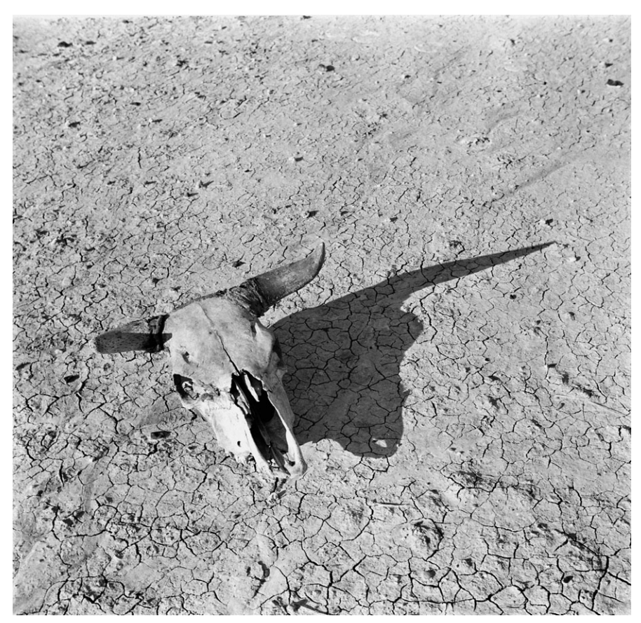
Fig. 2 Arthur Rothstein, Cattle Skull, Badlands , gelatine silver print, 1936 (George Eastman House, Rochester, New York)

When subjects smiled into the camera, they were stage-managed into more somber poses; sharecroppers who wore their best clothes to be photographed were told to change into ragged everyday wear, persuaded not to wash begrimed hands and faces for the camera. (Solomon-Godeau 1991: 179)