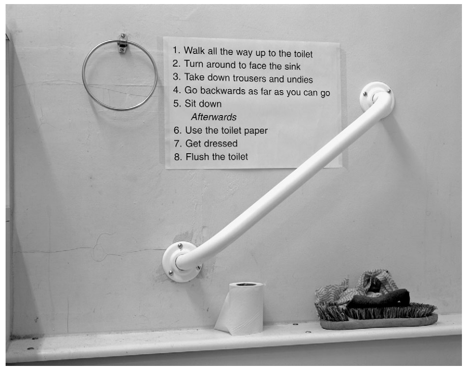
Fig. 8 Edmund Clark, Single Medical Cell, 2007.

direct representations of struggle might fail to—and, in doing so, the images offer an ethical opening to alterity through profoundly changing the way we see the world.