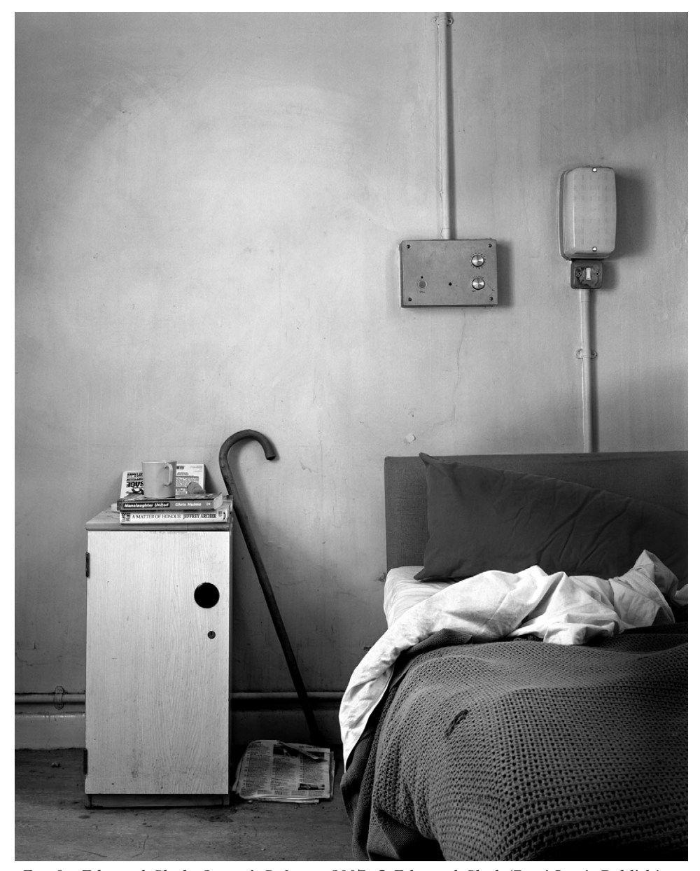
Fig. 9 Edmund Clark, Inmate's Bedspace, 2007.

a great deal of collective activity is involved in this field of cultural production, which further acts to differentiate professionals from amateurs in the creation of images and the making of their distinctive reputation. Yet, the situating of photography in the network of contemporary art institutions is not without problems, not least as it perpetuates certain kinds of elitism and further removes documentary from the dynamics of news reporting to the white walls of galleries.