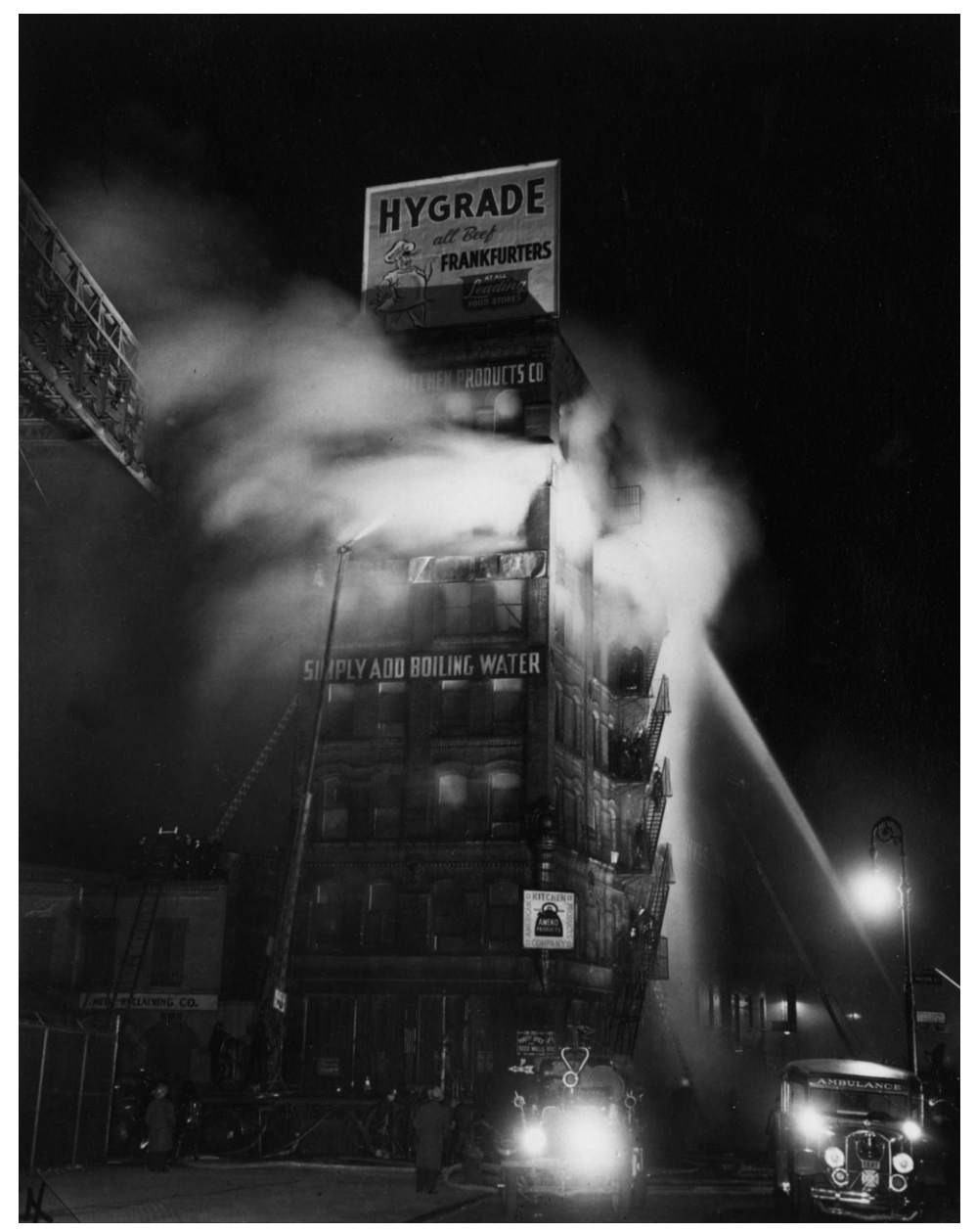
Fig. 4 Weegee (Arthur Fellig), Simply Add Boiling Water, 1943

to be controversial and influential. Such themes and styles are developed in the 1960s and 1970s by the 'new' documentarists like Lee Friedlander, whose work explored the potential for photographs to convey differing levels of ambiguity, intricacy and shadow.