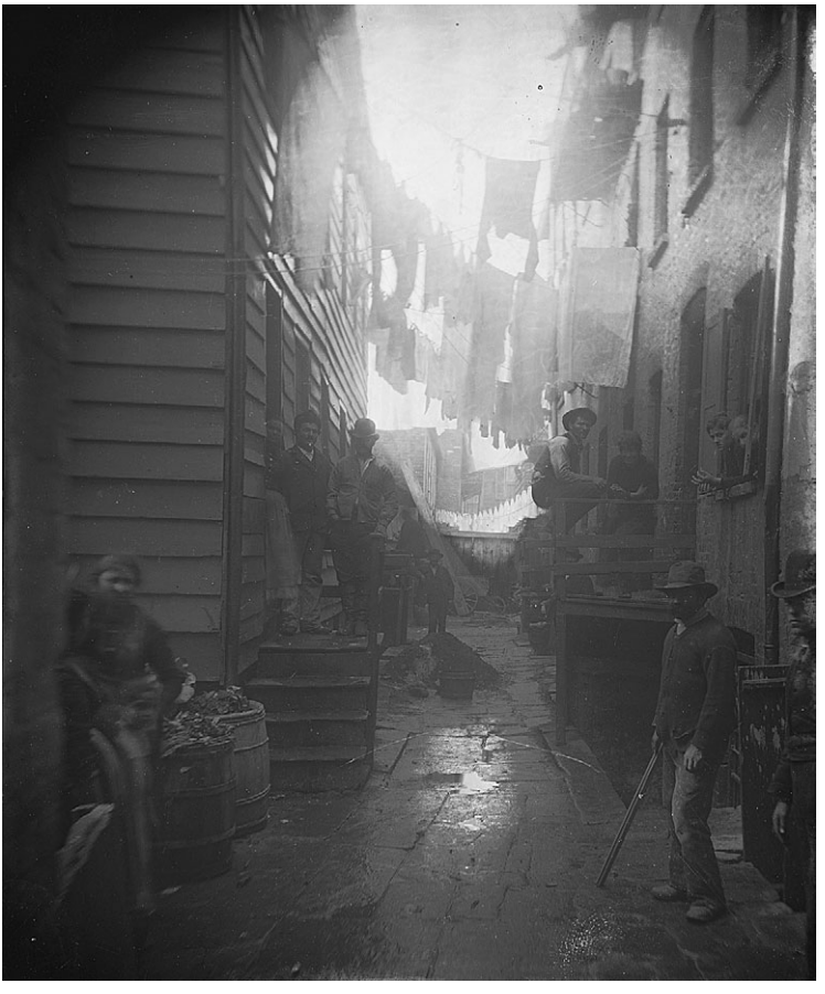
Fig. 1 Jacob A. Riis, Bandits' Roost, New York, bromide print, 1888 (Museum of the City of New York)