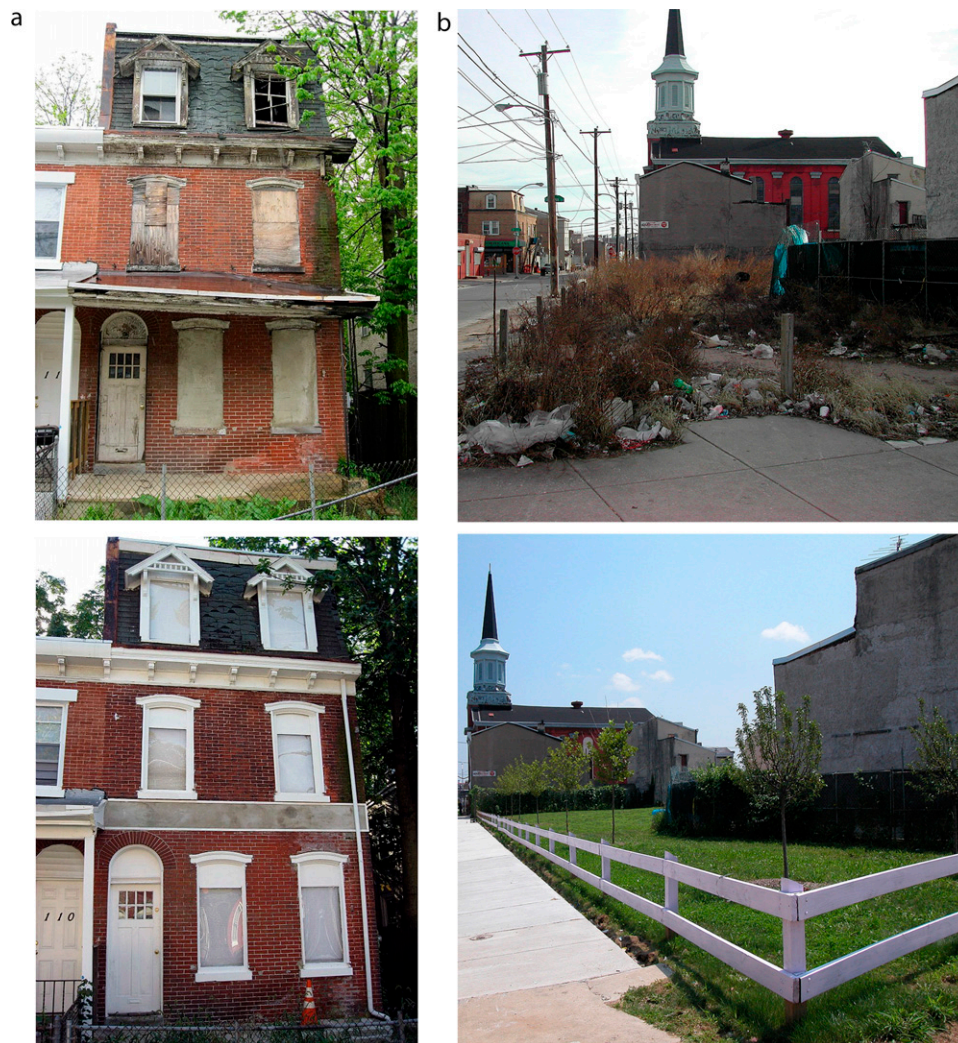
FIGURE 1—Before–After Examples of Remediation Treatments of (a) an Abandoned Building and (b) a Vacant Lot: Philadelphia, PA, 1999–2013

outcomes and sociodemographic factors in the areas surrounding each building or lot by using ArcGIS. For the abandoned buildings, we calculated these metrics monthly, and for the vacant lots, we calculated these yearly. We used the longitude–latitude locations of all assault outcomes to calculate a kernel density estimate and interpolate the assaults per square mile at the centroid of each building or lot. We assigned the value of each sociodemographic factor to the longitude–latitude location of the centroid of its block group and then we used an inverse–distance weighting calculation to interpolate the value of the sociodemographic factor at the centroid of each building or lot. In this way, crime and sociodemographic measures