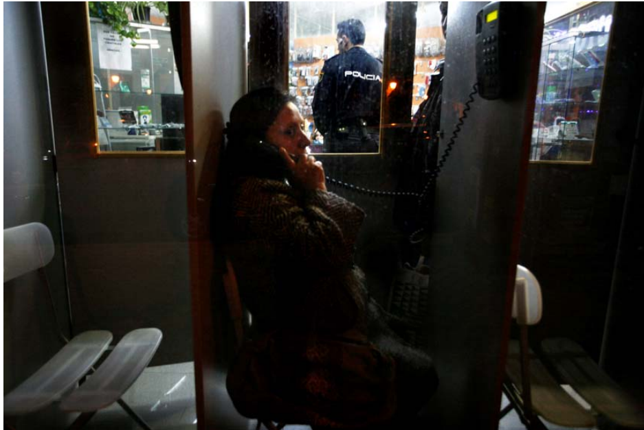
National Police officer inside a locutorio in the neighbourhood of Usera in Madrid, January 2011.

One police union representative told Amnesty International: “if you have to identify foreigners, whoever looks like a foreigner, you go where you will find them”. 28