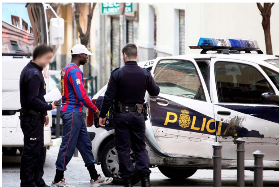
A man from subsaharan Africa is taken to a police station, Lavapiès neighbourhood, Madrid, April 2010

This form of “preventive detention” of an individual who has provided identity documents is neither a detention for the purpose of identification, nor pre-charge detention. According to Inmigrapenal, a group of law professors and criminal law experts, the “preventive detention” of individuals who have provided proof of their identity has no legal basis, contrary to Article 17.1 of the Spanish Constitution, Article 9 of the International Covenant on Civil and Political Rights (ICCPR) and Article 5.1 of the European Convention on Human Rights (ECHR). 50