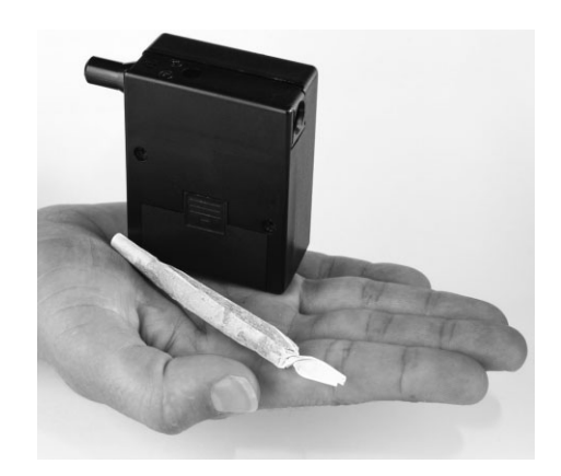
Figure I Topography measurement device

Finally, to investigate whether cannabis smoking topography is a predictor of cannabis dependence severity independent from other exposure determinants,