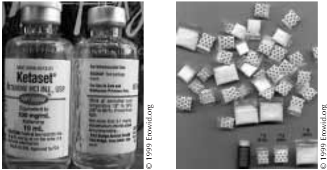
Figure 3: Ketamine vials and bags containing ketamine powder

The pharmaceutical form of the preparations used in medicine is an injectable solution of the racemic mixture of ketamine hydrochloride in water (10, 50 or 100 mg/ml). The solution is packaged in small sealed glass vials.